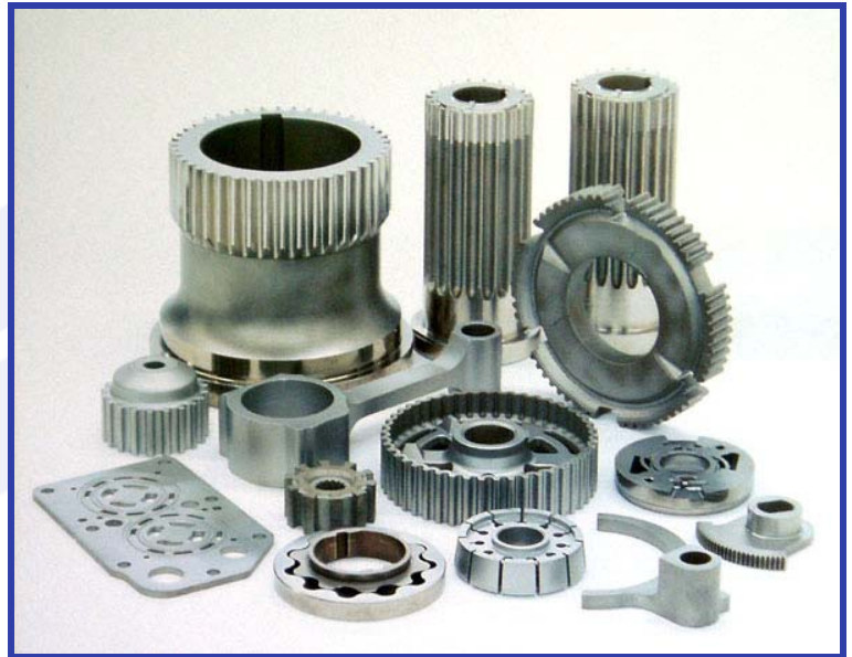
Wide Range of PM Tooling Applications

Strict Adherence to Exacting Quality Standards