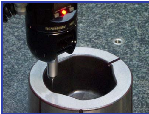
Guaranteed Quality and Reliability

Precision Products, Inc. specializes in providing the close tolerance, high volume forge tool components you need - when you need them. With our solid modeling software, sophisticated CNC programming and CNC manufacturing capabilities we produce forge tool dies that our customers count on for product reliability, quality and repeatability.