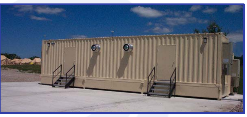
Rugged, Industrial Grade Components and Assemblies