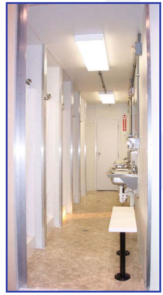
12-Shower Unit with Mechanical Room, Utility Room and Additional/Optional Features

ReMS have many available options and are custom designed to support your individual needs.